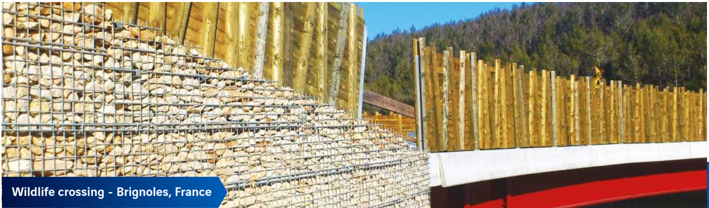
Wildlife crossing - Brignoles, France

This wealth of expertise has led Geoquest to develop processes offering common advantages: