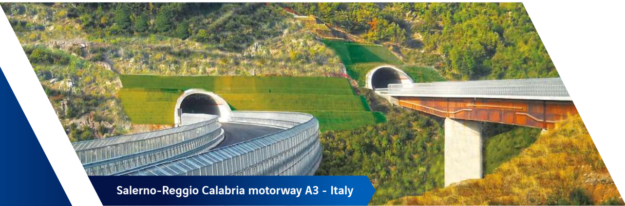
Salerno-Reggio Calabria motorway A3 - Italy

Due to the modularity of the GeoTrel™ system and portability of its components, this solution is readily adapted to remote areas.