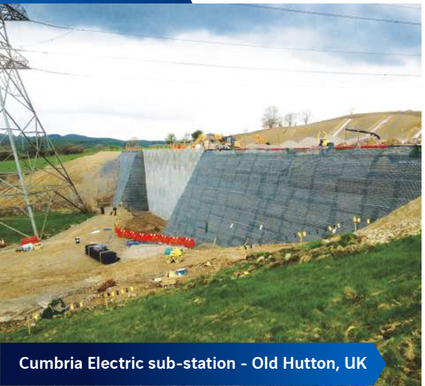
Cumbria Electric sub-station - Old Hutton, UK

As the world leader in mechanically stabilized earth , Geoquest has a presence in five continents, and benefits from both local and international expertise.