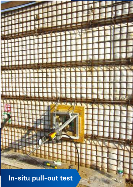
In-situ pull-out test

The GeoTrel™ system is the combination of welded wire mesh facing and geosynthetic reinforcing strips. The technical performance of this system has been proven on complex projects, even for tall and heavily loaded Reinforced Earth® structures. The GeoTrel™ system is one of the most cost-effective solutions for reinforced soil structures.