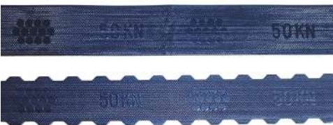
GeoStrap® reinforcing strip

As with all Reinforced Earth® structures, the GeoTrel™ system is designed according to the governing international standard for its location.