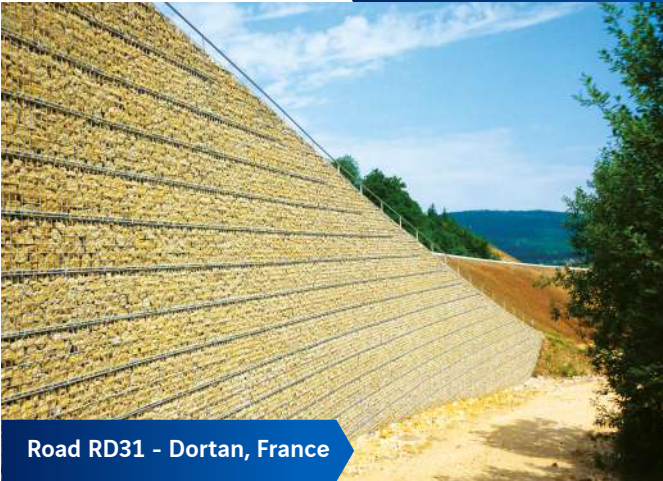
Road RD31 - Dortan, France