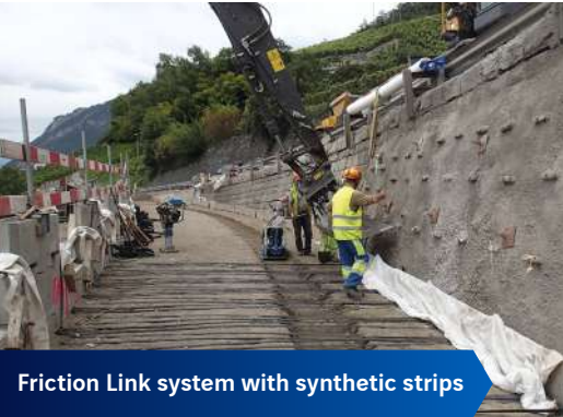
Friction Link system with synthetic strips