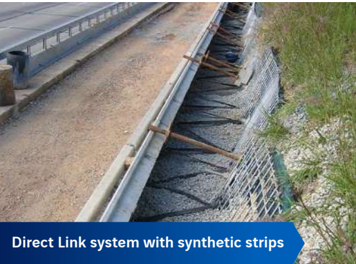
Direct Link system with synthetic strips