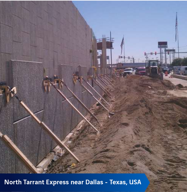
North Tarrant Express near Dallas - Texas, USA

The existing structure could be a soil nail wall, Reinforced Earth® wall or other retaining wall, or an existing natural feature such as sloped terrain or bedrock. Whatever its origin, a specific assessment is required to ensure that the existing structure is safe enough or needs evaluation of the consolidated works to support the new load configuration.