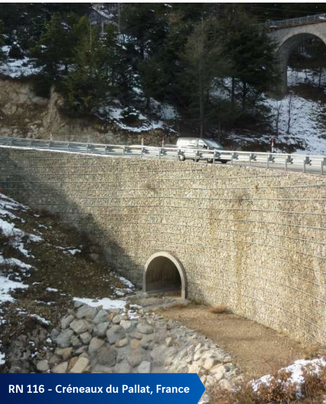
RN 116 - Créneaux du Pallat, France