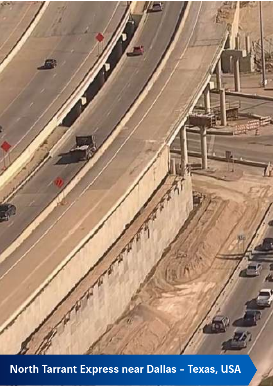
North Tarrant Express near Dallas - Texas, USA

Due to the increase of traffic, providing a widened of platform is often necessary. In restricted urban areas the construction of new ramps is often just in front of existing ramps. A standard retaining wall would have the drawback to partially dismantle the current ramp in order to build the new one. The TerraLink® system enables the construction of the new ramp while keeping in place the existing wall, maintaining traffic use for most of the construction time.