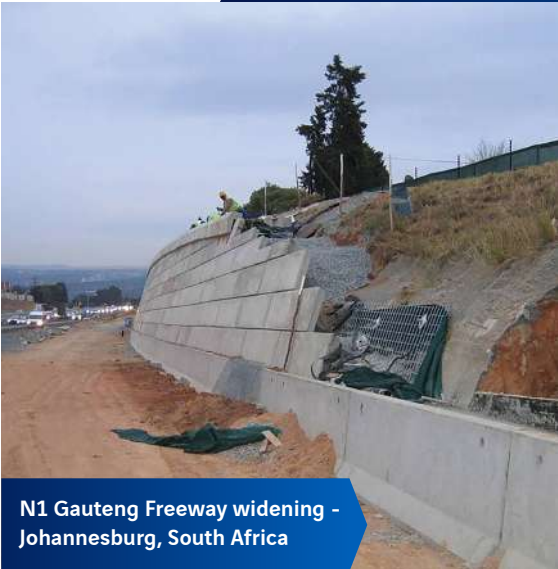
N1 Gauteng Freeway widening - Johannesburg, South Africa