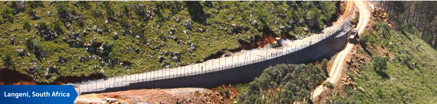
Langeni, South Africa

This wealth of expertise has led Geoquest to develop processes offering common advantages: