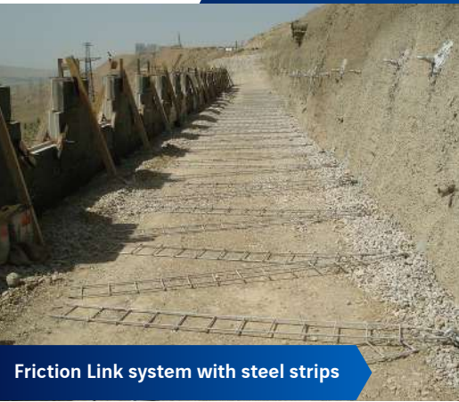
Friction Link system with steel strips

TerraLink® elements are similar to those used for Reinforced Earth® solution: soil reinforcements (steel or geosynthetic), connected to modular facing systems (precast concrete panels, welded wire mesh and connection parts). These elements are placed between well compacted backfill layers. The main feature is that reinforcements are linked to the rear part (backface) of the system through the existing structure, which enables combination or continuity of the reinforcements between the narrow Reinforced Earth® wall and the existing structure.